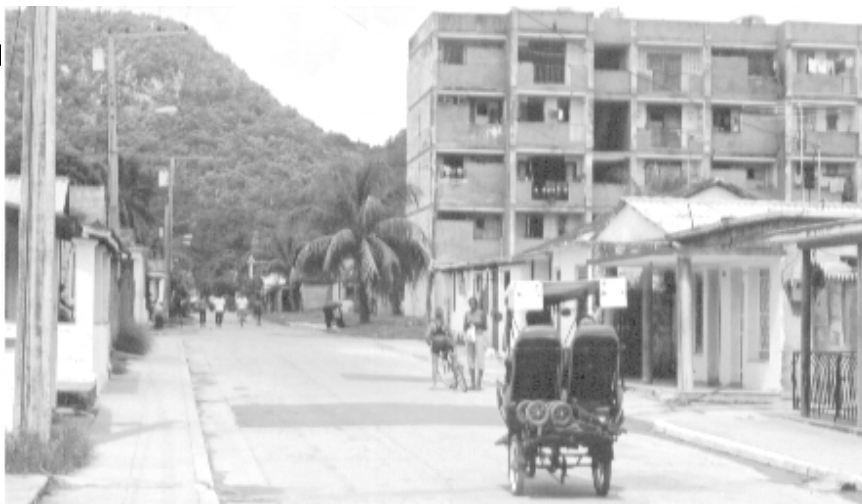
Typical Cuban apartments in the city of Nueva Gerona on the Isla de la Juventud.

Under the care of the Department of General Integral Medicine we took part in an inaugural program set to provide us with a general overview of the Cuban medical system with a specific focus on the delivery of primary care. We were each paired with a family doctor whom we would shadow at their neighbourhood consultorios and their daily afternoon visits to their patients homes. With only 700 patients to each doctor, we observed how thorough and familial the patient-physician interaction could be. We also spent time in the next organizational level of health care delivery, policlinicos, centers with all the various medical specialties including naturopathy, physi-