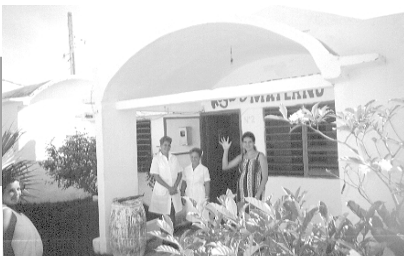
Patient, doctor and nurse outside the Hogar materno